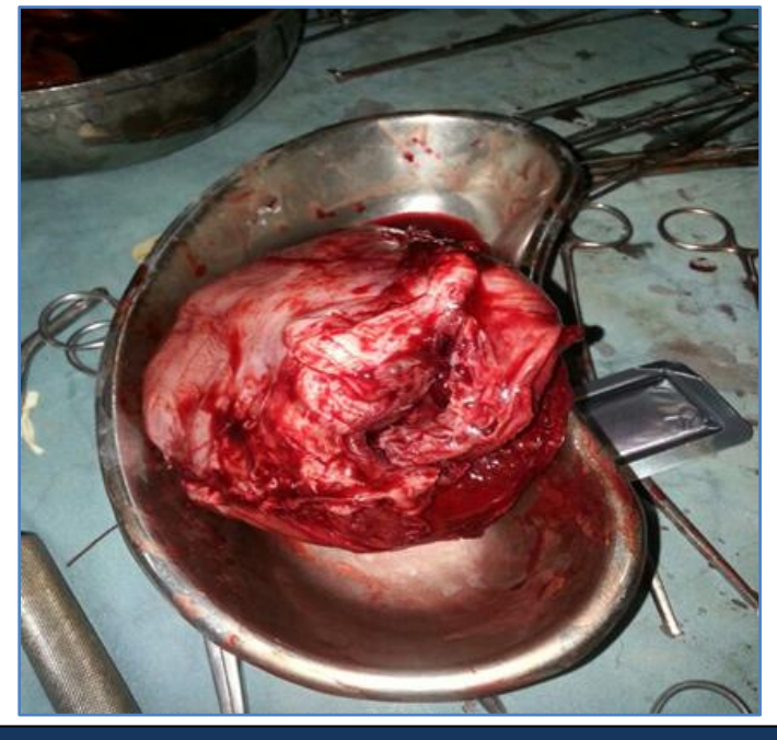
Figure 2: showing uterine specimen post hysterectomy

DISCUSSION: Uterine inversion during caesarean section is supposed to be a rare life treating emergency complication. But still we believe that, it's a very rare complication which occurs during caesarean. In the literature unique case of cervical inversion<sup>2</sup> and uterine torsion of inverted uterus<sup>3</sup> are noted during caesarean section.